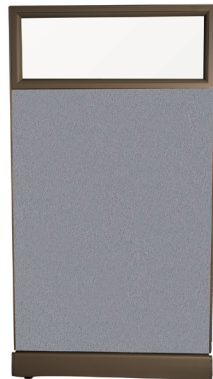
PANEL W/ 14" GLASS STACKER Base panel fabric = Keystone Series 7961 Seagull

Refer to the Devon fabric cards for additional fabric options