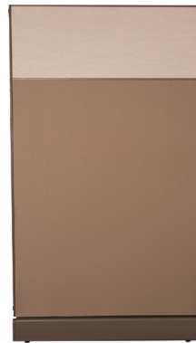
PANEL W/ 14" FABRIC COVER STACKER Base panel fabric = Keystone Series 7954 Taupe Stacker panel fabric = Aspen Series 7915 Comet Sandshell